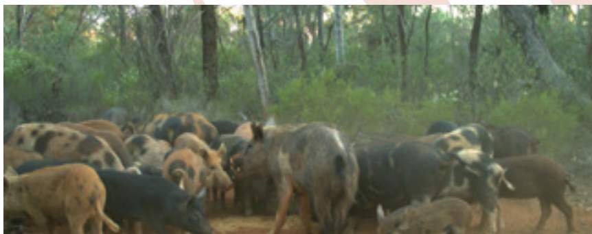
Figure 9: Feral pigs feeding from a ground deployed bait station