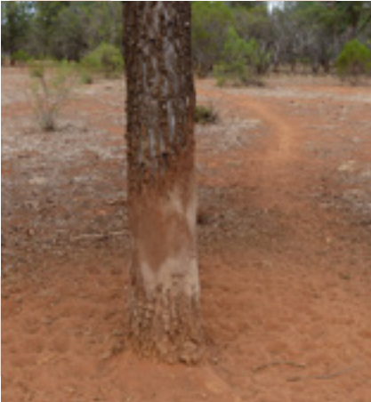
Mud rub marks on a tree