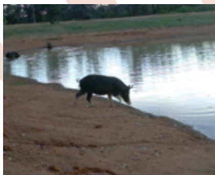
Figure 3: Feral pigs visiting a water-point in the afternoon.

In the hill country of eastern Australia the best time for baiting is generally in late autumn, in the tropics of northern Australia its towards the end of the dry season and in the semi-arid rangelands it is when it is hot and dry.