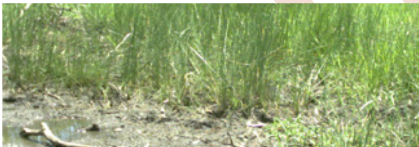
Figure 2: Poor conditions for baiting at the same site a few months later.