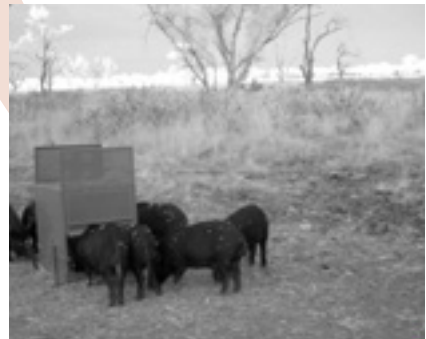
Figure 8: Camera monitoring shows that some pigs in the mob are still not confident to feed from the HOGHOPPER®, so a couple more days pre-feeding would be advised.

Once the site is cleared of pre-feed, place an equivalent amount of toxic bait at the station in a similar manner to how the pre-feed was laid (on the ground in trails, small piles or in HOGHOPPER®'s). Feral pigs are cautious animals and small changes may cause them to change their feeding behaviour.