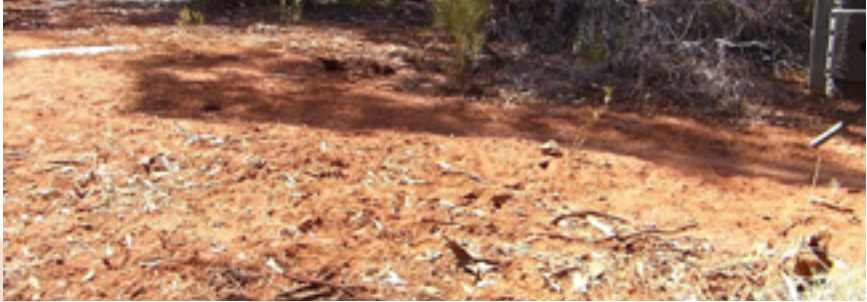
Figure 7: Bait station setup for monitoring with a remote camera.