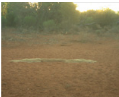
Figure 5: Example of feral pig bait station on regular travel pad between a day-camp and feeding area.

The pre-feed bait material should be a non-toxic version of the poison bait material you plan to use when you start poisoning, so the animals are accustomed to eating it. The bait should be laid in a trail (Fig. 5), or in several small plies, so that larger animals cannot dominate and eat all the bait. Bait can also be delivered using a HOGGOPPER ® , which is a feral pig specific bait delivery device. Attractants such as Carasweet ® or molasses may help encourage bait-uptake.