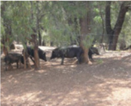
Pigs rubbing against trees