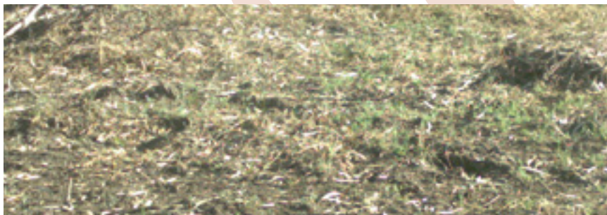
Figure 1: Good conditions for baiting in the Macquarie Marshes, New South Wales.

This field guide mainly focuses on poison baiting, but there are several aspects