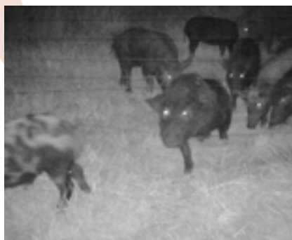
Figure 4: Feral pigs moving through a fence between dense habitat and a preferred feeding ground.

Spacing distances between stations will depend on a number of factors including resource abundance, topography, climatic conditions and feral pig home range size. A good starting point is >1km apart.