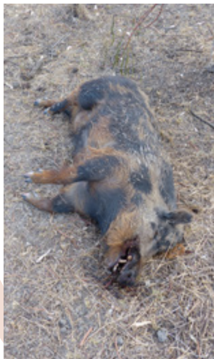
Figure 11: Large boar found dead after feral pig baiting program.

Feral pig dung is commonly found along warn travel-pads and at high use areas. Dung may vary in appearance according to their diet, and dung can last in the environment for many months depending on the environmental conditions.