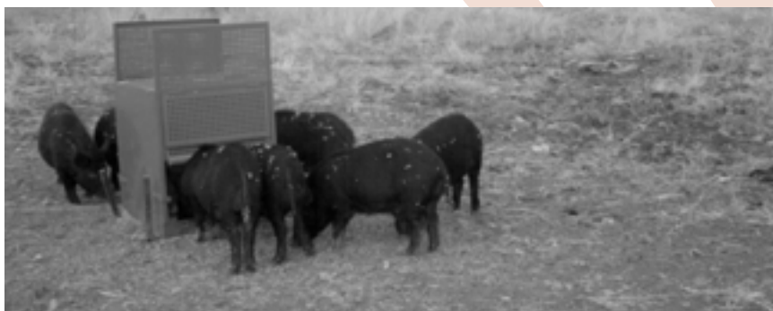
Figure 10: Feral pigs feeding from a HOGHOPPER®