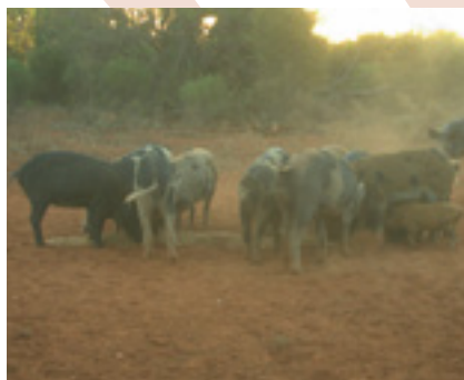
Figure 6: Feral pigs visiting station and feeding together because bait was laid in a trail.

The images can then be used to work out how many feral pigs are feeding, so the right amount of bait can be delivered. Cameras can also allow you to make sure all animals are feeding properly before poison bait goes out (Fig. 8) and they can help determine if non-target species are present.