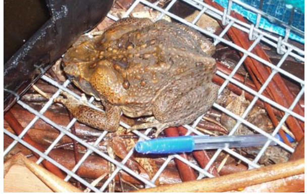
Cane toad caught in a super trap at Mebbin NP during a trial.

Toad carcasses can be disposed of by burial in a garden; ensuring that the depth is sufficient so native and domestic animals don't dig up the carcasses. Alternatively they can be placed in a lidded compost or garbage bin.