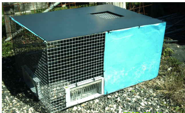
An example of a Super trap

When set up with adequate water and all parts functioning correctly, the Super Trap can house captured toads humanely for an extended period of time.