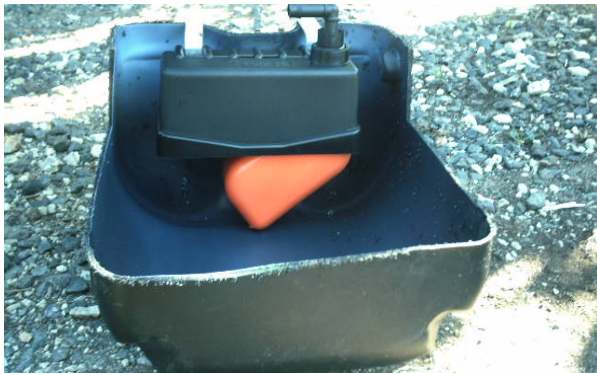
Trough and float valve supply water to captured toads