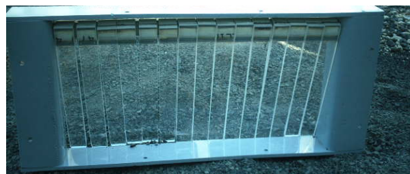
Door showing finger gates manufactured by Frogwatch, Northern Territory